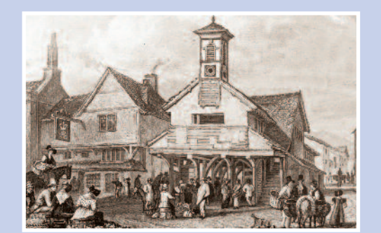
Ashburton Market Place c.1820. The Rose & Crown inn stands on the left of the market house.

Left: The former inn, Half Moon, nestles at the head of Manaton village green in 1889.